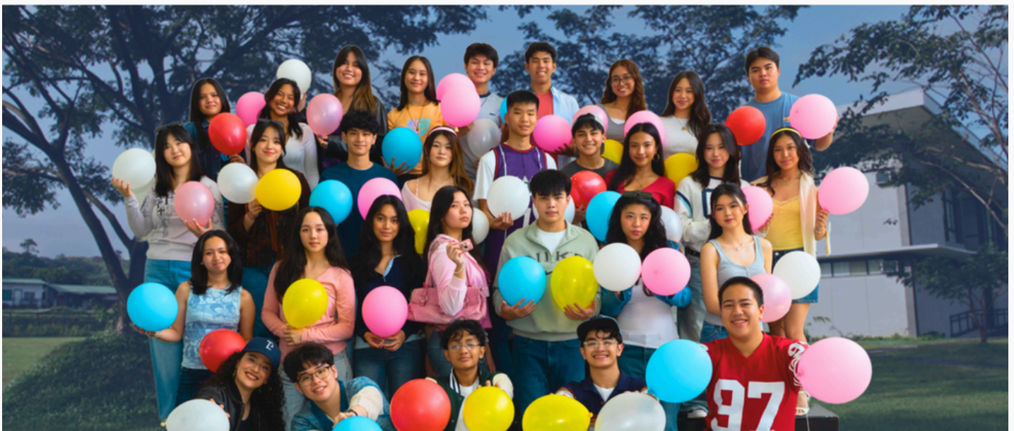
The Beacon Academy's Class of 2025: Infinitum